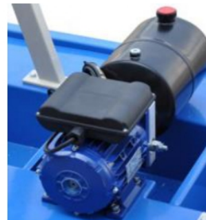
Hydraulic Power Pack