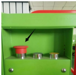
Emergency Stop Button on Platform