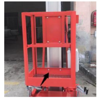
Toe Protection Board