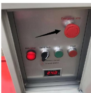
Emergency Stop Button on Ground