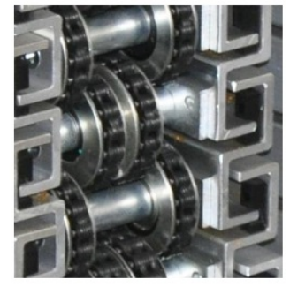
Multi Guide Pulley & Double Chain Mechanism