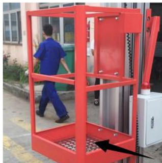
Anti-skid Floor on Platform