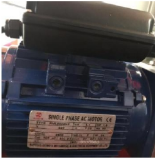
AC Power, 220V Single Phase