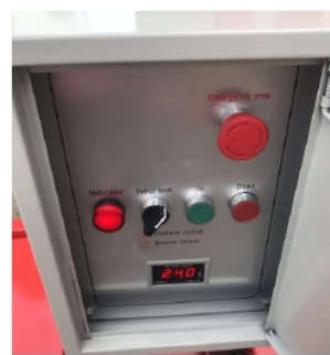
Operation from Ground