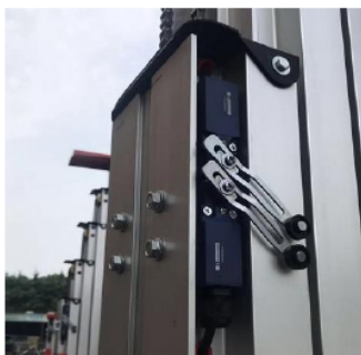
Dual Limit Switch for Safety