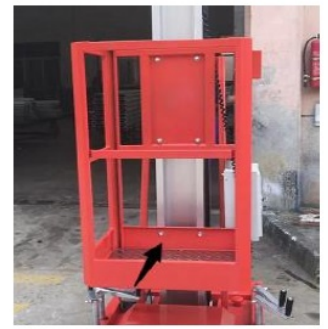
Toe Protection Board