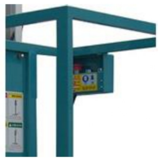
Operation from Platform