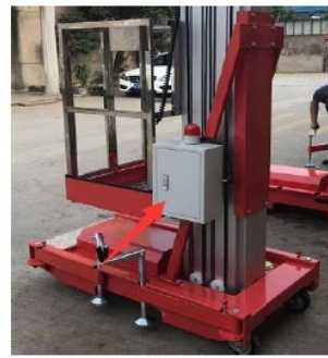
Key Lock Power Switch