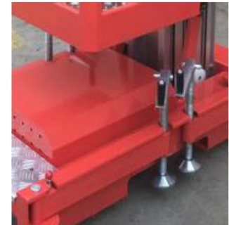
Swing Type Outrigger with Lock Pin