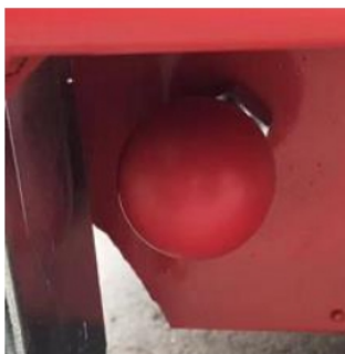
Auxiliary Lowering Switch