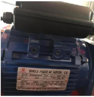
AC Power, 220V Single Phase