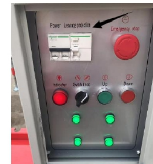
Short Circuit & Leakage Protection System