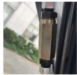
Anti-burst valve on Cylinder